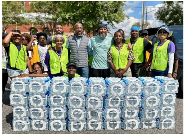
Senator Reverend Warnock distributing bottled water to the Augusta, GA community following Hurricane Helene

Georgians did not wait for help; they got to work. Families cleared roads. Farmers salvaged crops. Community organizations and businesses provided food, water, and shelter to their neighbors. Senator Reverend Warnock joined them, traveling across the state to deliver supplies, meet survivors, and secure commitments from federal leaders to help Georgia get back on its feet.